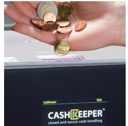
Accepts, validates and pays out all coins