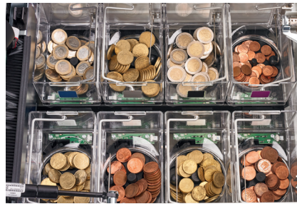
Each coin has its own hopper. Maximum reliability and speed