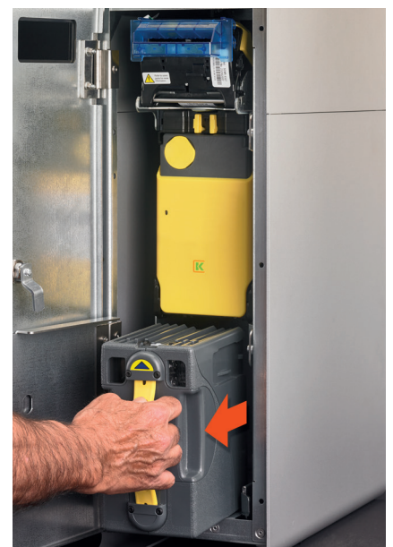
Collection of banknotes in a closed module. Nobody sees or touches the money