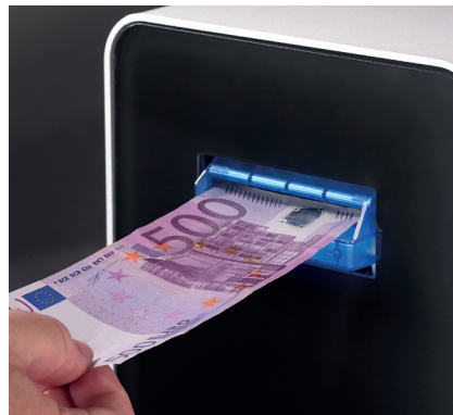
Accepts and verifies all banknotes, including € 500 note